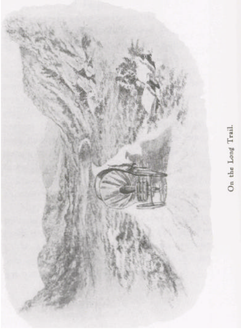
On the Long Trail.