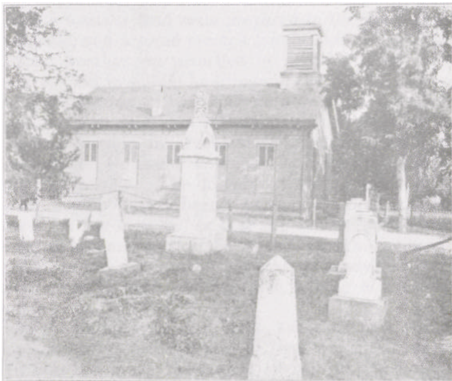
CHURCH AT NEW ANTIOCH, O.