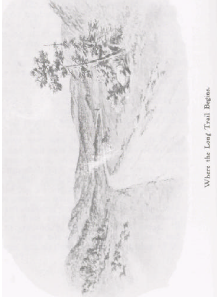
Where the Long Trail Begins.