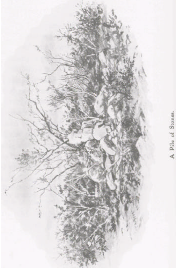
A Pile of Stones.