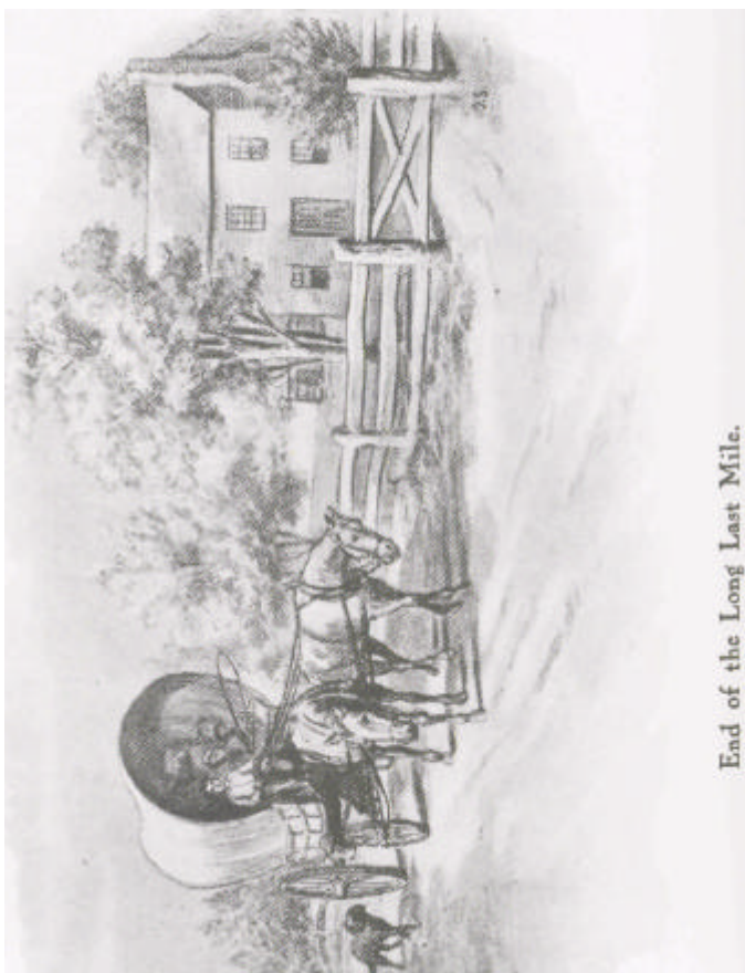
End of the Long Last Mile.