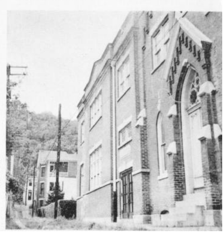
SUNDAY SCHOOL PLANT